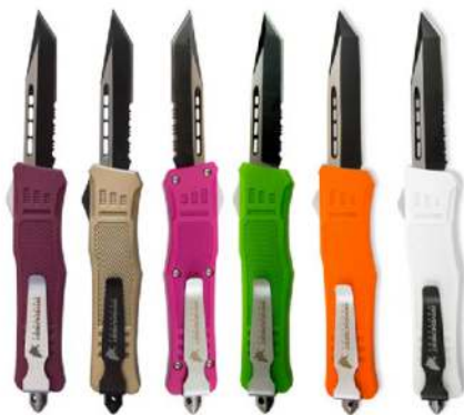
Raven Crest knives are available in a variety of colors.